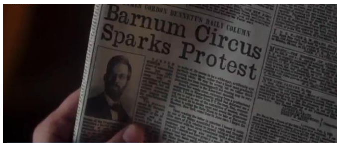
Figure 4. News about P.T. Barnum and the Circus

Barnum : “Shame of the city. The protests cement Mr. Barnum reputation as a purveyor of the offensive and indecent.”