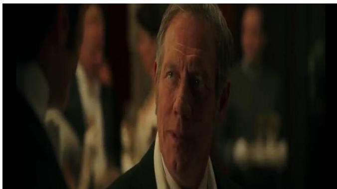
Figure 2. Mr. Hallet demeaning P.T. Barnum in the party

Mrs. Hallet : "Are these ?" Barnum : "Yes, yes, those are your granddaughters" Charity : "Phineas, not here." Barnum : "Not here? You afraid I am gonna embarrass your parents in Front of their fancy friends? I really don't think I have that power. An insignificant man like me who was clearly destined to lead an insignificant life." Mr. Hallet : "All that fortune, and still just the tailor boy."