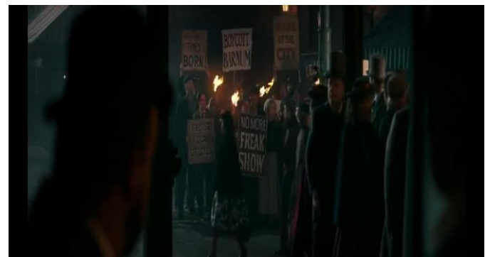
Figure 1. Some people opposed to circus performance